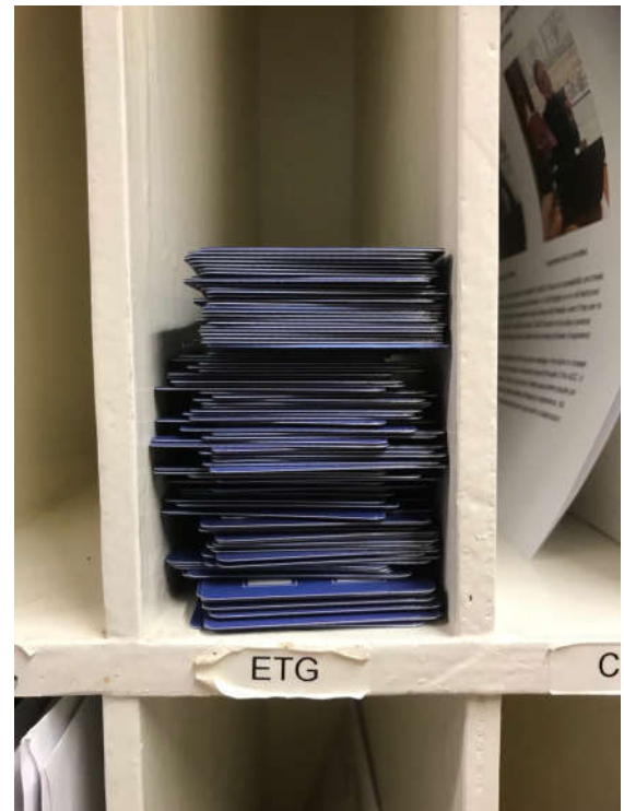
All the lonely membership cards – where do they all belong?

An Englishman's home is his castle, and a Membership Secretary's pigeon hole is theirs (see right). This humble 5cm x 20cm wall fitting would be my only domain, and it'd probably be a good idea to give out these membership cards. This would hopefully be done by friendly reminders and instructions to members about how to pick up their cards. If not, I'd send them out via the University Mail Service , if for no other reason than giving members the excitement of a full pidge.