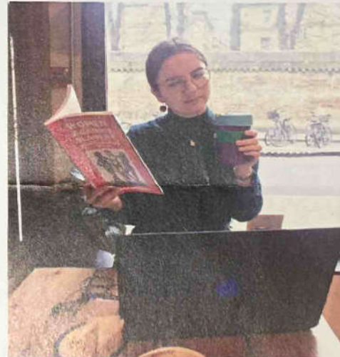
^ organised and committed

As club secretary, I would hope to strengthen CUADC's focus on accessibility and break down the idea that, due to its age and prominence, it is still largely run on old-fashioned values. I want to encourage new members to get involved with theatre, even if they are no longer freshers and feel like it might be too late. CUADC should not be about personal connections, but about furthering all kinds of talent and involving all levels of experience.