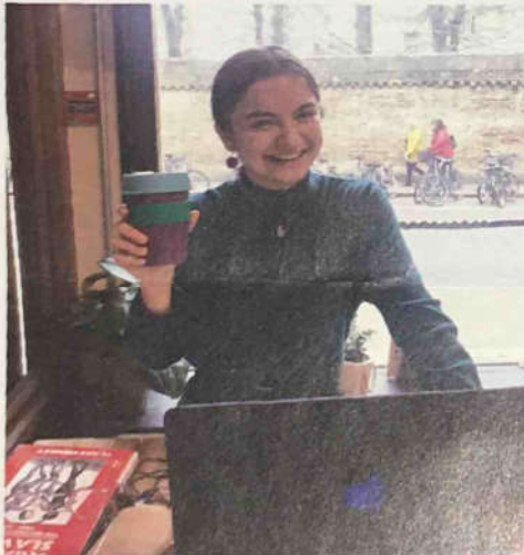
^ friendly and approachable

I see the role of Secretary as an exciting opportunity to have a tangible impact on the way the society is run and perceived. The function of a secretary, on top of some heavy duty admin, is to maintain clear communication of the society's work and progress, making sure that no one feels alienated or ignored. Therefore, I think I am well-suited to the role, as I am friendly and approachable, as well as organised and committed.